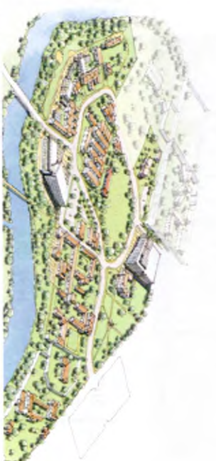
NPPRAG's concept design for FSHP

Despite its widely acknowledged National Significance, the proposal has been fast-tracked with limited public awareness and public consultation that pursued a pre-determined agenda that stifled any innovative vision.