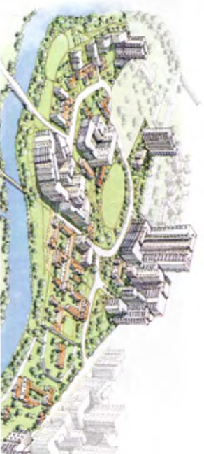
Interpretation of Urban Growth's Concept Design for FSHP

Mailing address: PO Box 748 Granville NSW 2142